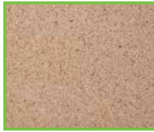
Mason Sand (63 bags per pallet)