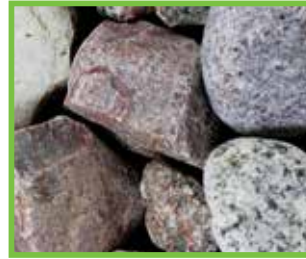
River Cobble 2-3" (63 bags per pallet, .5CF/Bag)