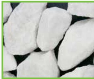
White Marble Stone (77 bags per pallet, .4CF/Bag)