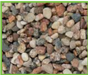
Pea Stone 3/8" (63 bags per pallet, .5CF/Bag)