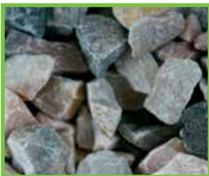
Mountain Blend (63 bags per pallet, .5CF/Bag)