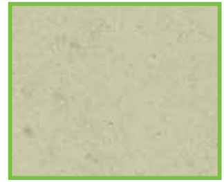
White Play Sand (63 bags per pallet)