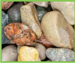
American Heritage Stone 1 1/2" (63 bags per pallet, .5CF/Bag)