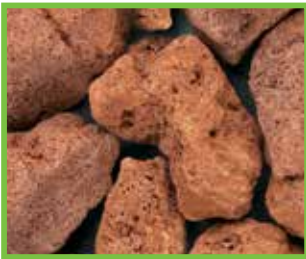
Red Volcanic Rock 3/4" - 1 1/2" (70 bags per pallet, 1.0CF/Bag)