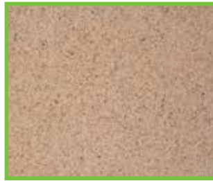
Play Sand (63 bags per pallet)