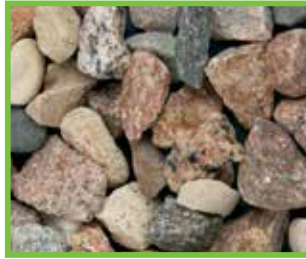
American Heritage Stone 3/4" (63 bags per pallet, .5CF/Bag)