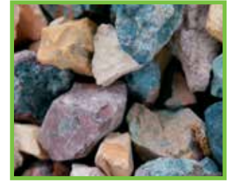
Western Sunset (84 bags per pallet, .5CF/Bag)