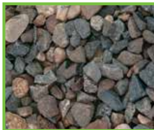
Multi-Purpose Gravel (63 bags per pallet, .5CF/Bag)