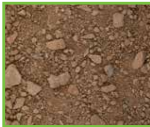
Paver Base (63 bags per pallet, .5CF/Bag)